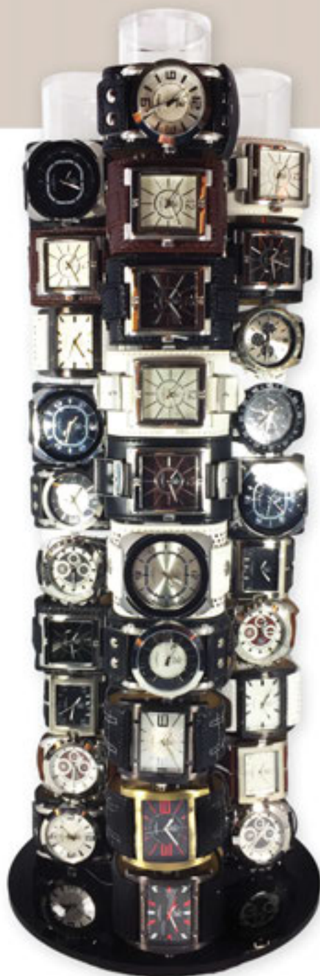
3 POLE ROTATING DISPLAY CODE: DB002

Get 2 FREE Cavaliere watches when purchasing the display