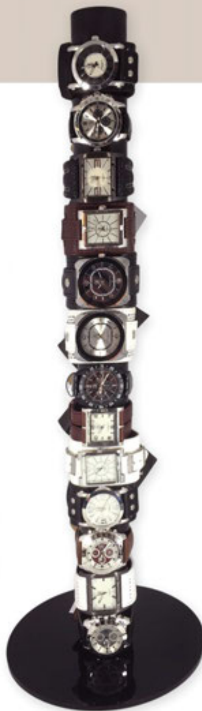
1 POLE ROTATING DISPLAY CODE: DB001

Get 2 FREE Cavaliere watches when purchasing the display