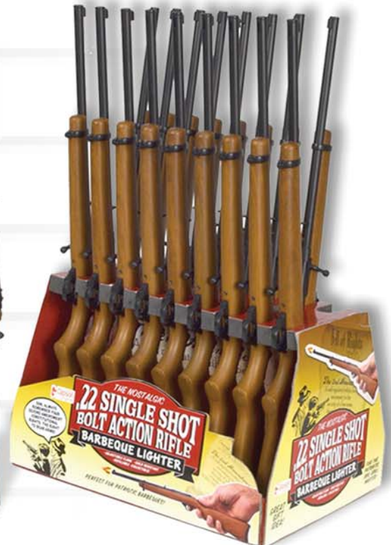
22 SINGLE SHOT BOLT / CODE: 21268