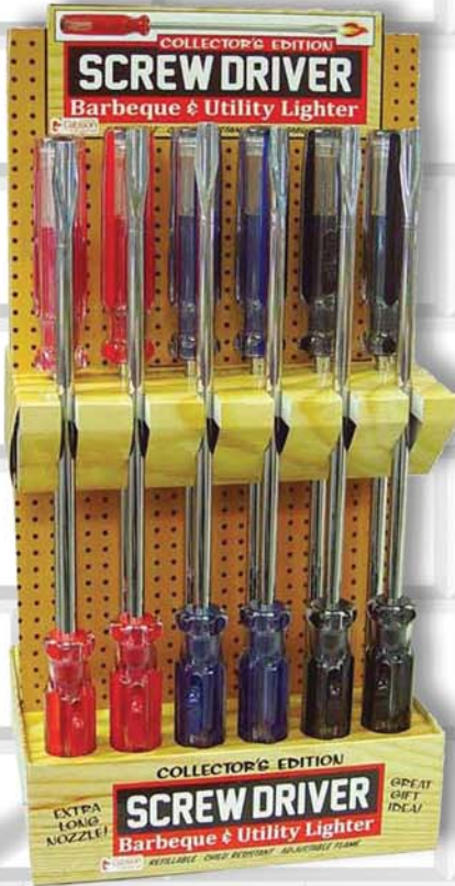
SCREWDRIVER / CODE: 21049