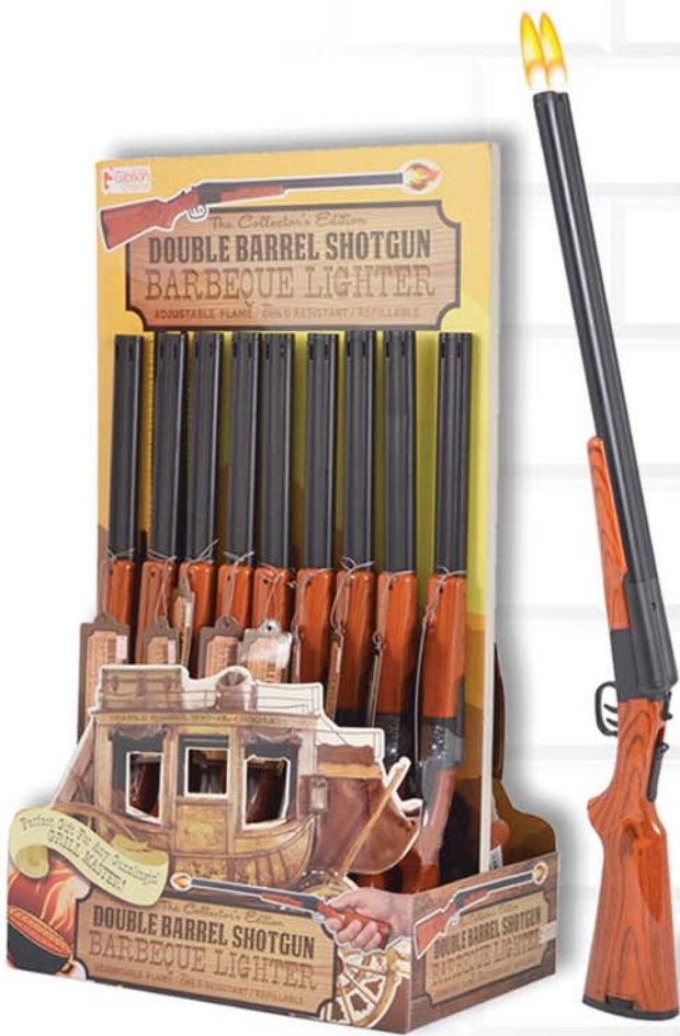
DOUBLE BARREL SHOTGUN / CODE: 21265