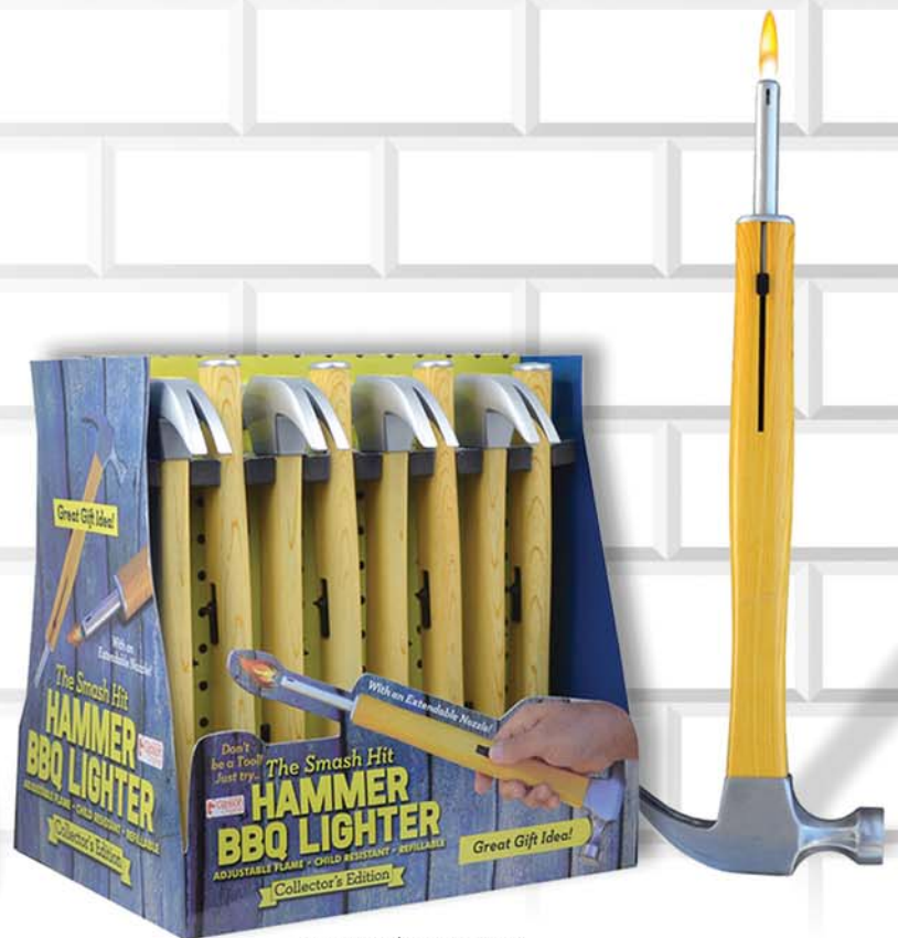
HAMMER / CODE: 21256