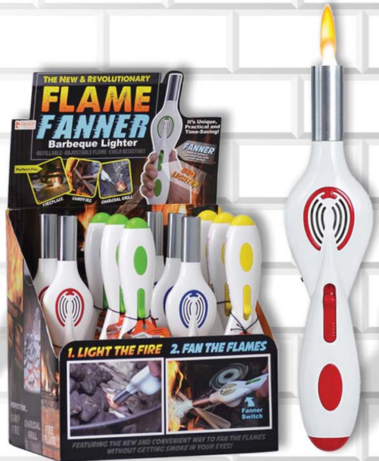
FLAME FANNER / CODE: 21274