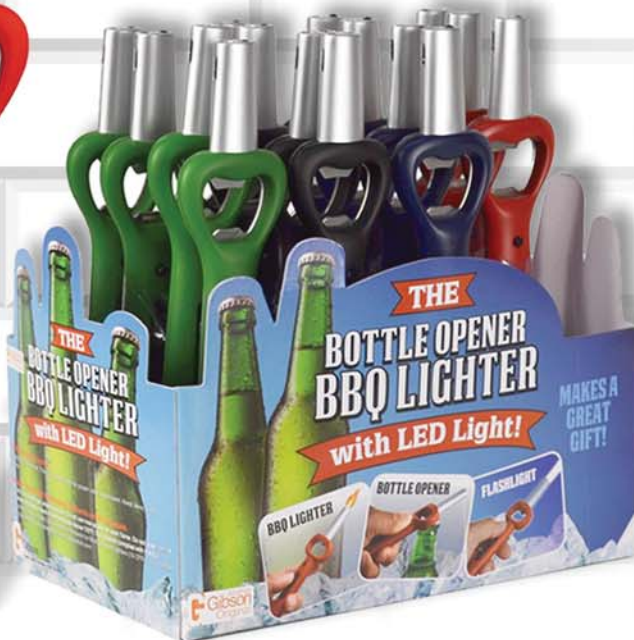
BOTTLE OPENER / CODE: 20775