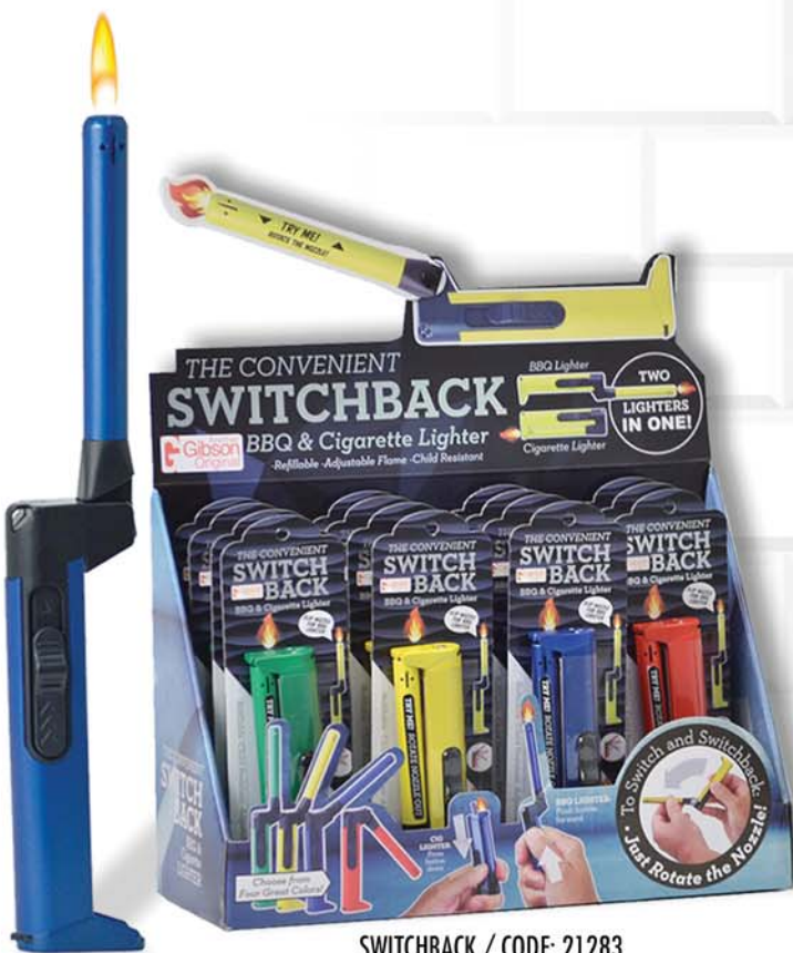
SWITCHBACK / CODE: 21283