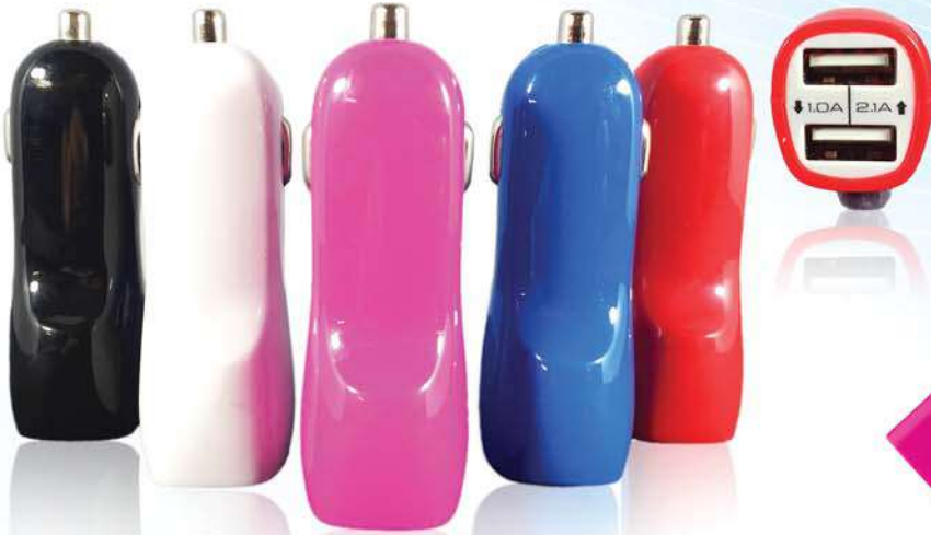
CELL12101 | 847589012075 DOUBLE CAR CHARGERS / 2 OUTPUTS: 1.0A AND 2.1A 5 ASSORTED COLORS