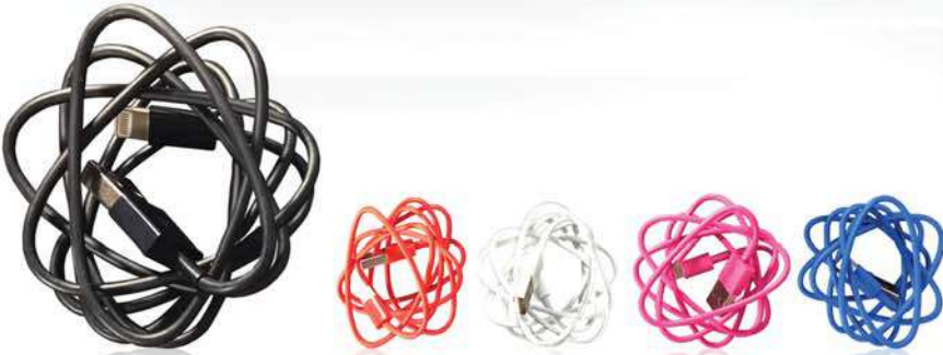
CELL12301 | 847589012129 CABLES FOR IPHONES 5&6, 1 METER 5 ASSORTED COLORS