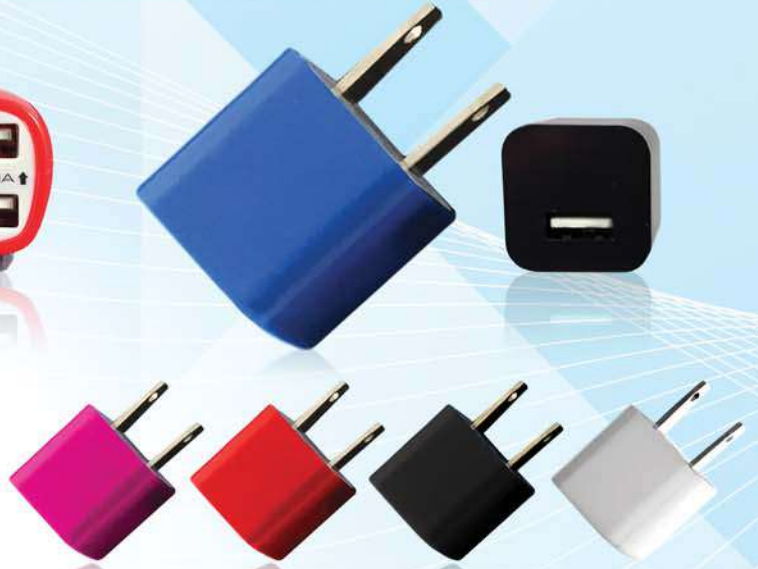
CELL12201 | 847589012099 SINGLE HOME CHARGERS 5 ASSORTED COLORS