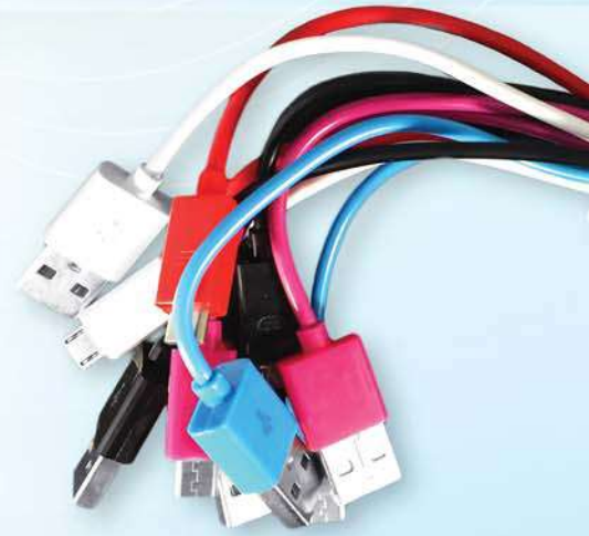
CELL12401 | 847589012174 MICRO CABLES, 1 METER 5 ASSORTED COLORS