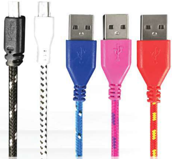
CELL12404 | 847589012167 BRAIDED MICRO CABLES - 1 METER 5 ASSORTED COLORS