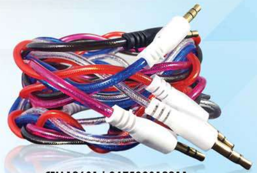
CELL12601 | 847589012211 AUDIO CABLES 5 ASSORTED COLORS