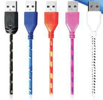
CELL12304 | 847589012150 BRAIDED CABLES FOR IPHONES 5&6 - 1 METER 5 ASSORTED COLORS