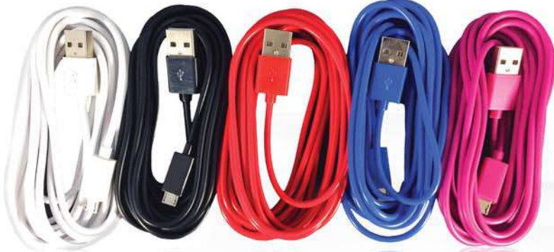
CELL12402 | 847589012181 MICRO CABLES - 3 METERS 5 ASSORTED COLORS