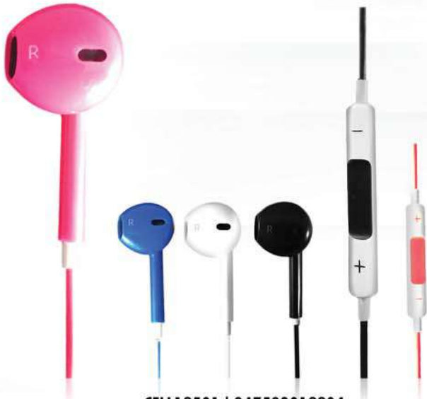
CELL12501 | 847589012204 EARPHONES WITH MIC 5 ASSORTED COLORS